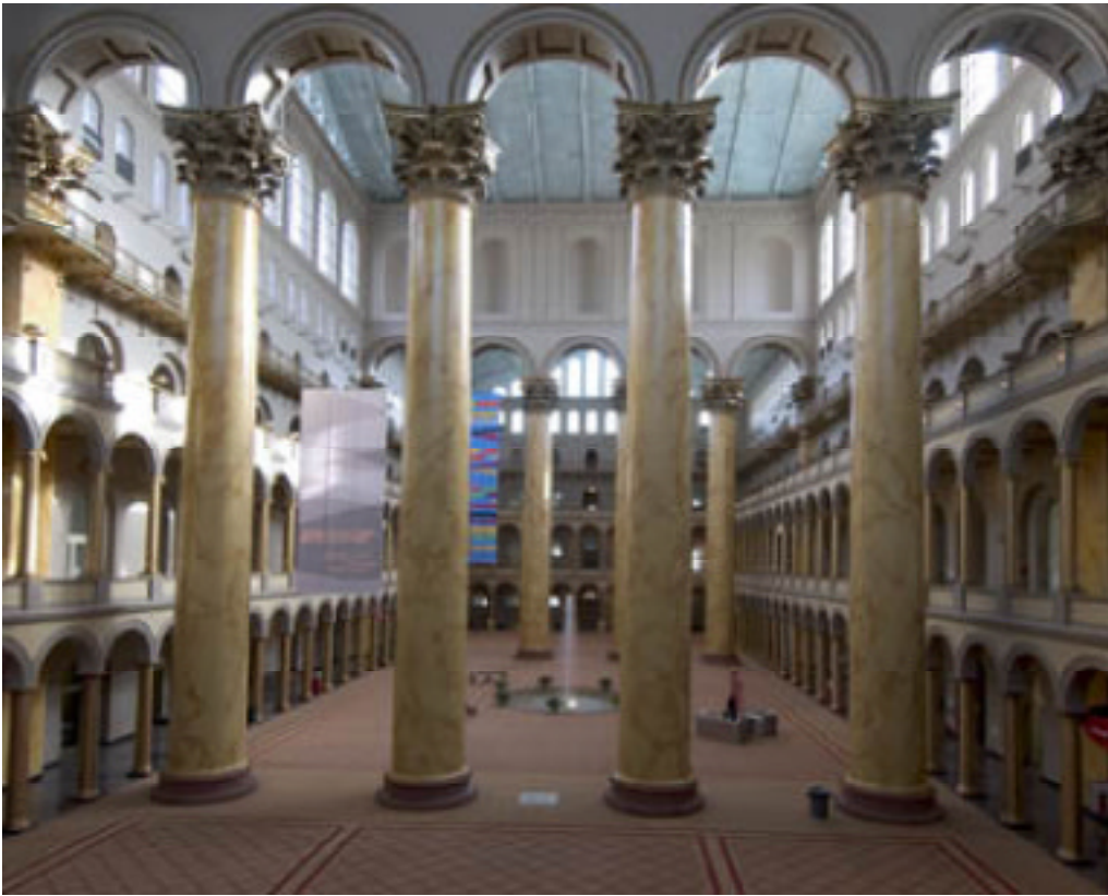
SSCC 's stalwart team of field trippers enjoy a day at the tripod-friendly National Building Museum and the Botanical Gardens in downtown Washington, DC